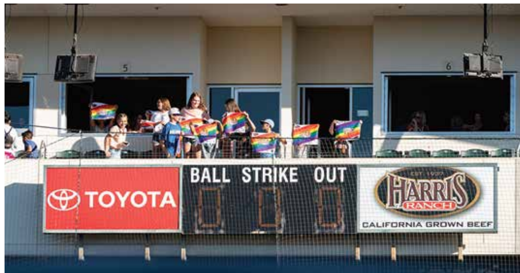
Kids waving their Rainbow Towels