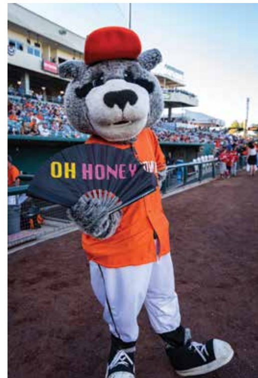
Dinger on the River Cats Equality Night