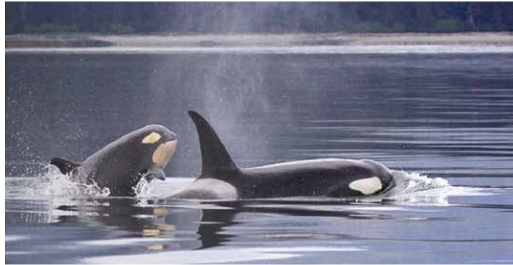
Using drones and Artificial Intelligence programs like SnotBot, scientists can gather information about whales from their "blows" without disturbing them.

Artificial Intelligence (AI), defined as the capability of machines to imitate intelligent human behavior and learn from data, is considered by many to be the final frontier of computing, and environmentalists and tech companies are now harnessing the power of AI to service the environment.