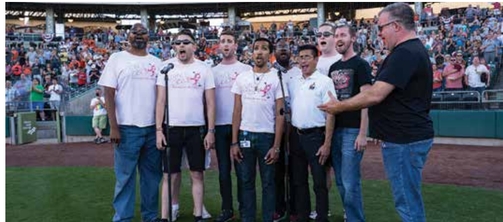
Gay Mens Chorus singing National Anthem