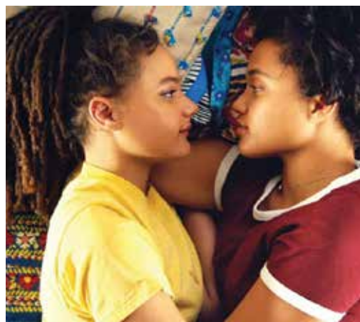
Sasha Lane and Kiersey Clemons costar in Hearts Beat Loud .

Hearts Beat Loud was playing at Sacramento's Tower Theatre as we went to press. Hopefully, the film will still be there when you read this. To find out, visit www.readingcinemasus.com/tower .