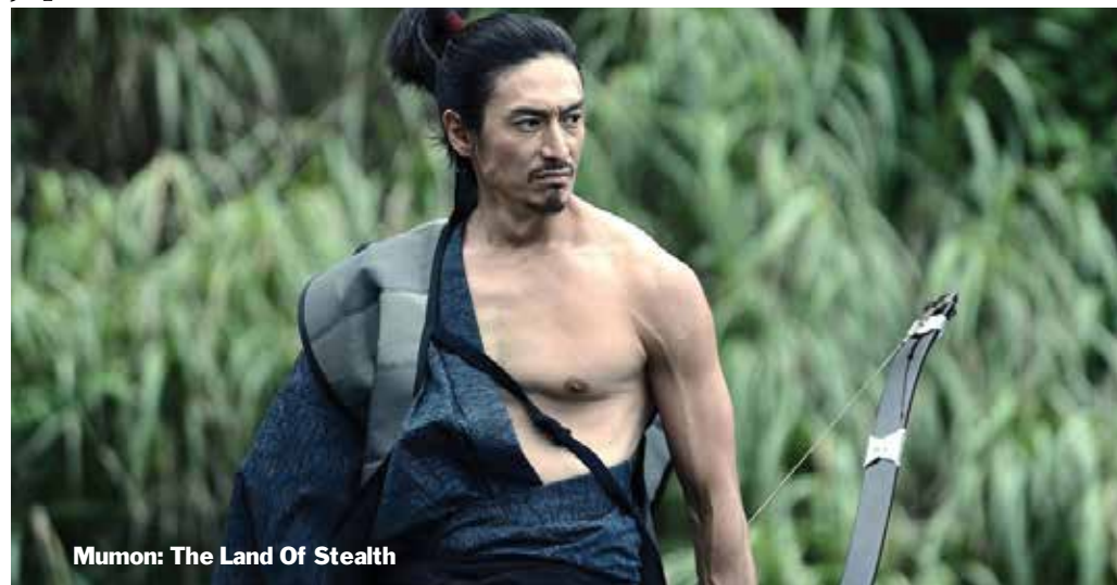
Mumon: The Land Of Stealth

The Sacramento Japanese Film Festival, which returns to the Crest this month, is one of only four film festivals in the continental United States that dedicates itself exclusively to Japanese cinema.