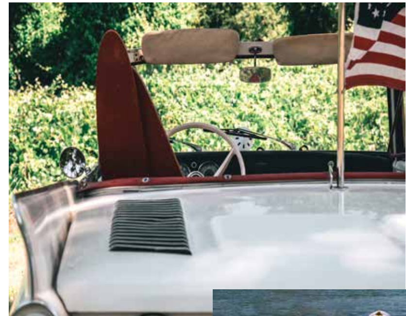
The Amphicar 770.