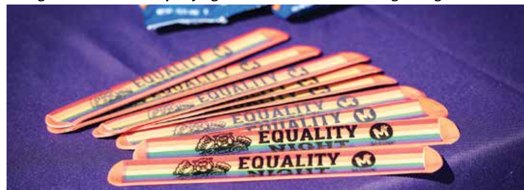
These Equality Sticks were loud enough to raise everybody's Pride