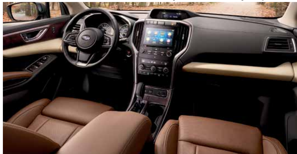
The 2019 Subaru Ascent's beautiful, leather clad interior offers the rows of seating for lots of people room.

Another standard feature proving the Ascent is a real-deal Subaru is how it drives. Drivers would be forgiven for thinking the Ascent feels more like a spritelier 5-passenger sedan than a 7-passenger behemoth. The all-new 2.4-liter boxer four-cylinder makes 260hp, and it makes all its 277lb-ft of torque at just 2,000rpm, so it's both quick off the line and passing. With a