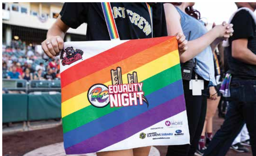
The Equality Night Towels were waving strong and proud!