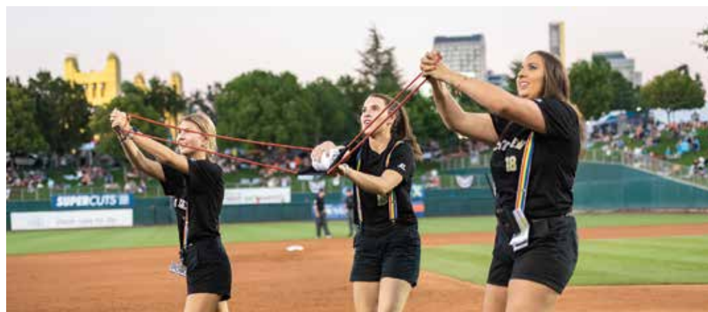
Even the Hot Dog Tossers got in the rainbow spirit