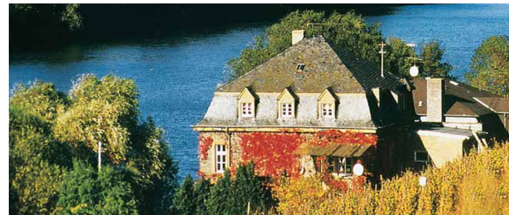
Situated on Germany's Mosel River among some of the world's most treasured vineyards, the Dr. Loosen estate has been in the same family for more than 200 years.

We have rolled into summer with a rush of heat. The temperature is rising and Sacramento, in the next two weeks, has six days forecast over 100 degrees and nothing less than a high of 95 degrees! Want to beat the heat? Refreshing white wines are on the list of items to buy to help cool off and lighten the spirit.