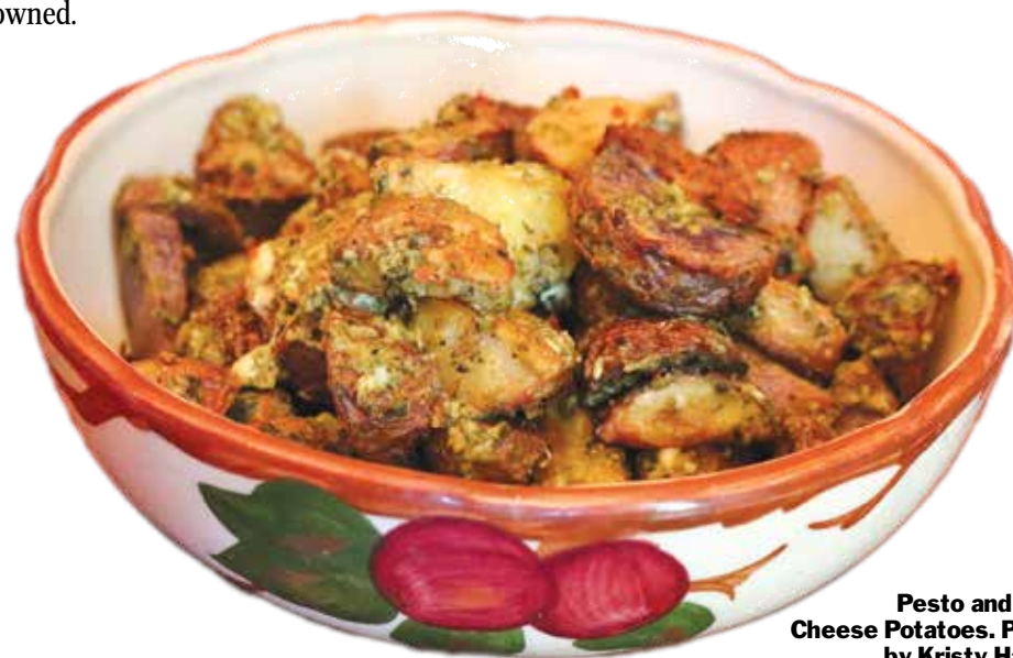
Pesto and Blue Cheese Potatoes.

Broil the potatoes until the pesto and blue cheese mixture forms a crust and they look browned.