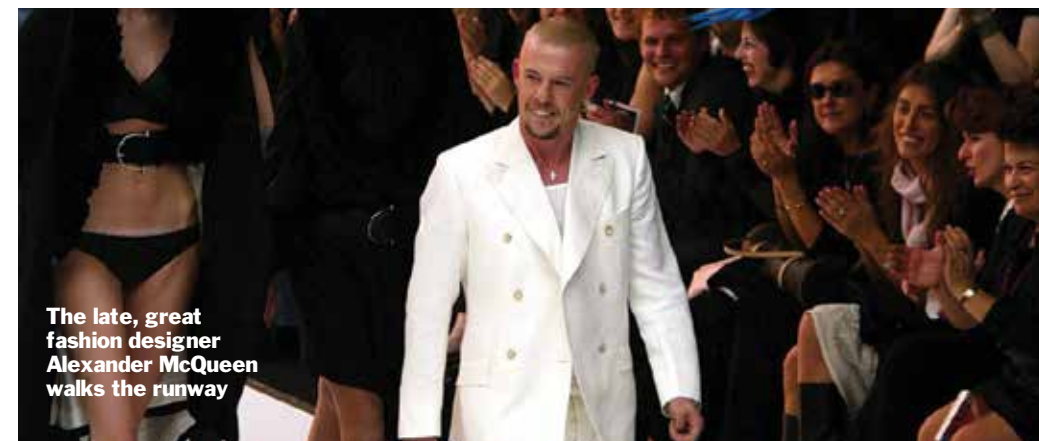
The late, great fashion designer Alexander McQueen walks the runway

In addition to the requisite sequels and superheroes, this particular cinematic summer has brought two new mini-trends to theaters: films about suicide ( Whitney and McQueen ) and wild and wonderful examples of what I am calling “new black cinema” ( Sorry To Bother You and Blindspotting ).