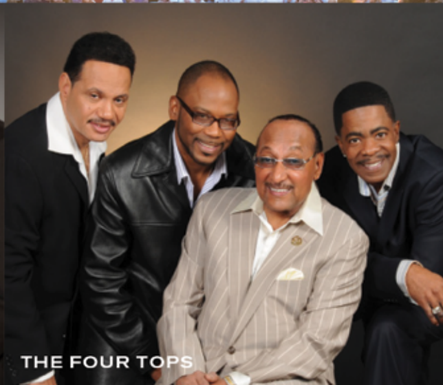
THE FOUR TOPS