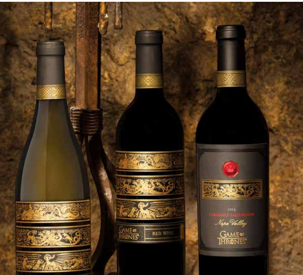
Game of Thrones has long given wine a prominent role in its scenes from the Seven Kingdoms. Now fans and fine wine drinkers can uncork a bottle of Game of Thrones wine on their own, as HBO Global Licensing and Vintage Wine Estates have just released a Chardonnay, a proprietary red blend and a reserve-style Cabernet Sauvignon that would bring a smile to the lips of any Lannister. Available at www.gameofthroneswines.com and stores around the country in April.