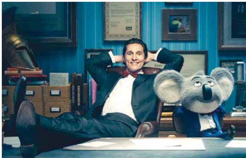
Matthew McConaughey voices the lead character in Sing

Twiggy, this colorful tale of theater hopefuls with stars in their eyes and greasepaint in their veins is an affectionate screen adaptation of Sandy Wilson's London/Broadway stage hit, which had given Julie Andrews her Broadway debut.