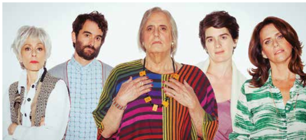
Cast of the award-winning Amazon series "Transparent?"