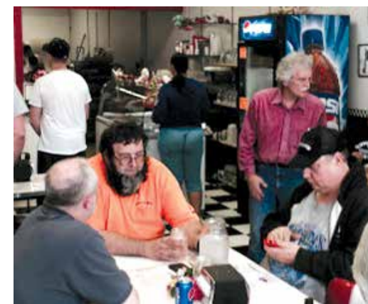
Was it bigotry or just good pizza that brought customers back to Memories Pizza?

This year the LGBT community laughed, cried, and celebrated together as news broke on issues important to us all. To refresh your memory on the year that almost was, here are our picks for the top headlines that had us talking in 2015.