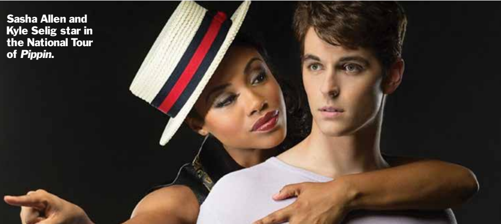
Sasha Allen and Kyle Selig star in the National Tour of Pippin .

The National Tour of Pippin plays Dec. 29 – Jan. 3 at Sacramento's Community Center Theater. Visit www.BroadwaySacramento.com .