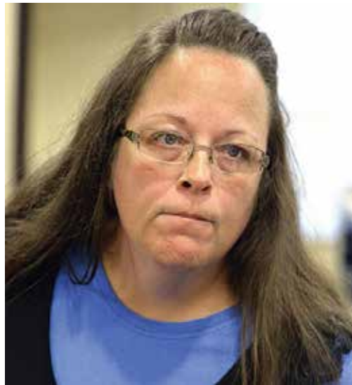
Was it about the law, religious freedom or Kim Davis?

It's highly unlikely, however, that either of those things will ever happen.