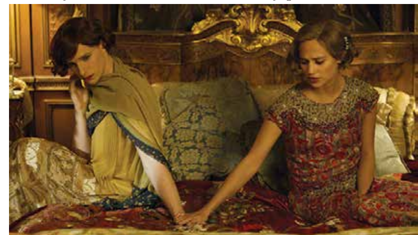
Eddie Redmayne and Alicia Vikander star in The Danish Girl .

Just in time for the holidays, the movie studios have gifted LGBT movie fans with two fabulous new films: “Carol,” a lipstick lesbian love story from the great gay director Todd Haynes, and “The Danish Girl,” featuring Eddie Redmayne in another Oscar-worthy performance.