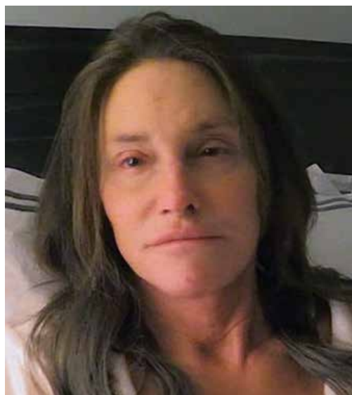
Some transitions you can make easier than others, and Caitlyn Jenner just couldn't find a way to leave the political party that hates her the most.

What motivated anti-gay movement-martyr Kim Davis to take on the Supreme Court by refusing to issue marriage licenses to same-sex couples is still up for interpretation – was she sticking to her religious convictions as she claimed, or was she hoping to cash in on the controversy like Memories Pizza? – but her eagerness to break the law worked in her favor. Despite spending five days in the clink, Davis became a household name who dominated headlines for weeks before compromising on the issue by allowing her office to grant the licenses – but without her signature.