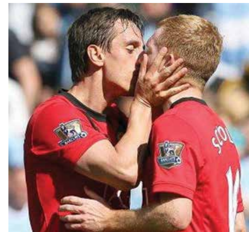
Passion runs deep in soccer, for both players and fans.

What happens when you “whitewash” a pivotal moment in LGBT history by focusing on an attractive, straight-acting, Caucasian male lead instead of telling the true story of drag queens, butch lesbians, trans women, and people of color who played a prominent role in the pop-off of the gay liberation movement? You get Roland Emmerich's Stonewall , the universally panned box office flop (it made less than $175K total), very loosely inspired by the 1969 Stonewall riots.