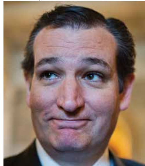
Although all the Republican candidates have expressed their support for repealing marriage equality, Sen. Ted Cruz has won the support of NOM.

Caitlyn Jenner has made several questionable statements since coming out in June – like revealing that she still plans to vote Republican, and encouraging trans people to dress the part more effectively so they don't make others uncomfortable. Yet despite all the criticism she's received since forging her life as a woman in the public eye, there's no denying that her high-profile transition has brought national attention to trans issues, and we could use more of it.