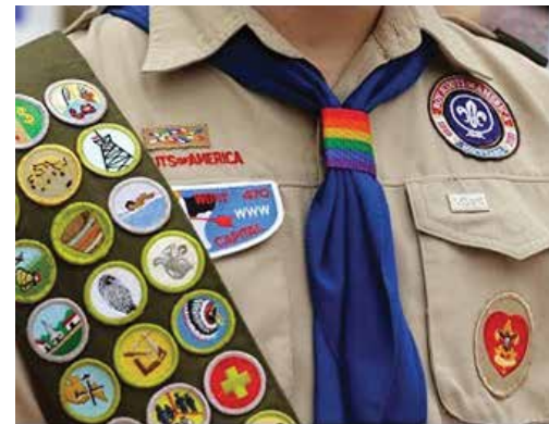
Lesbians and gay men can now take leadership positions in the BSA, although escape clauses do still allow troops with strong religious connections to exclude them locally.

Atheists and agnostics still aren't allowed to join the Boy Scouts of America because their beliefs conflict with the organization's “Duty to God” principle (and we're sure they're all beat up about it), but as of July 26, 2015, gay and lesbian adults can serve as scout leaders, a reversal of a policy that prohibited “open and avowed” homosexuals