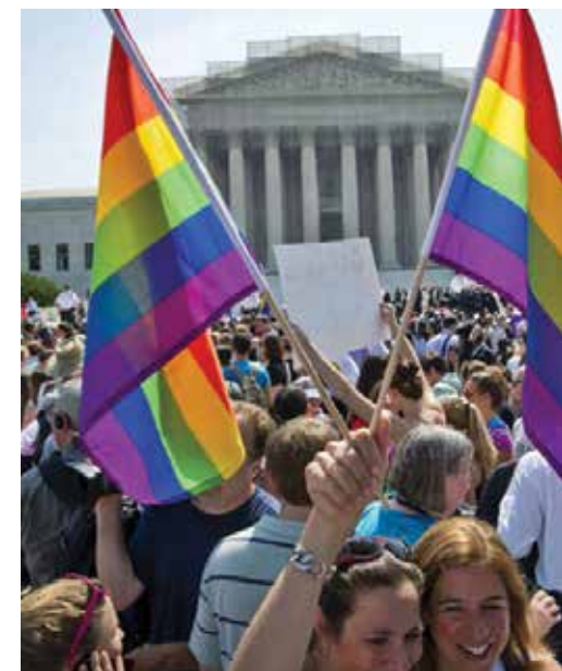
Celebrations like this one at SCOTUS broke out all across the U.S. after the Court's decision.

The power of the Internet – and idiocy – ran amuck early in the year when the Christian owners of Walkerton, Indiana's Memories Pizza told a local news station it wouldn't cater a hypothetical same-sex wedding, in response to a religious objections law Indiana had recently passed. Backlash ensued – the parlor received so much criticism it shut its doors for eight days – but in the meantime, donations to the tune of nearly $1 million flooded in from dummies around the world that pledged their financial support to uphold discrimination.