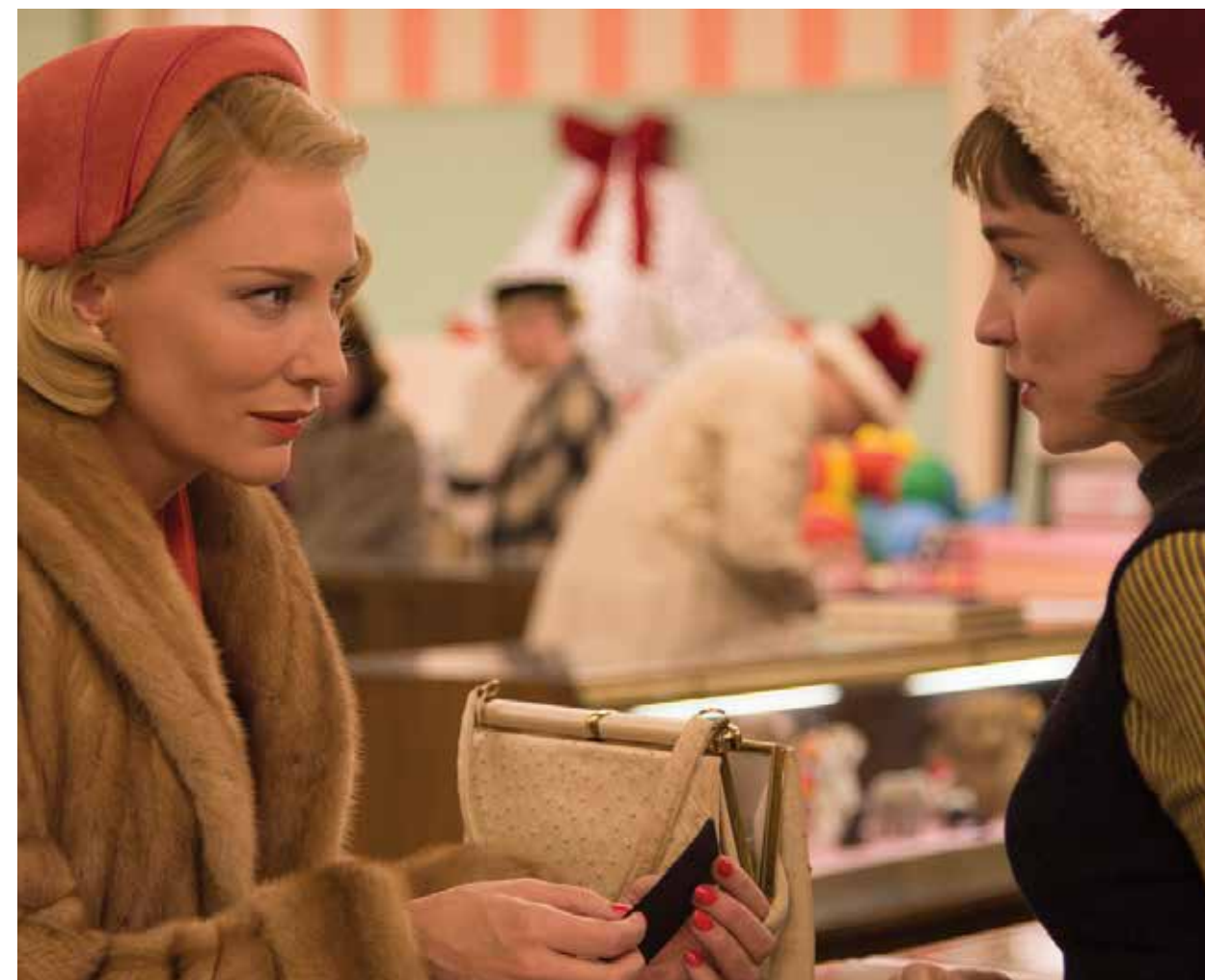
Rooney Mara and Cate Blanchett star in Carol .