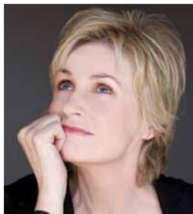
Jane-Lynch.

Jane Lynch will perform at Mondavi on Thursday, April 9 at 8 p.m. Visit www.MondaviArts.org .