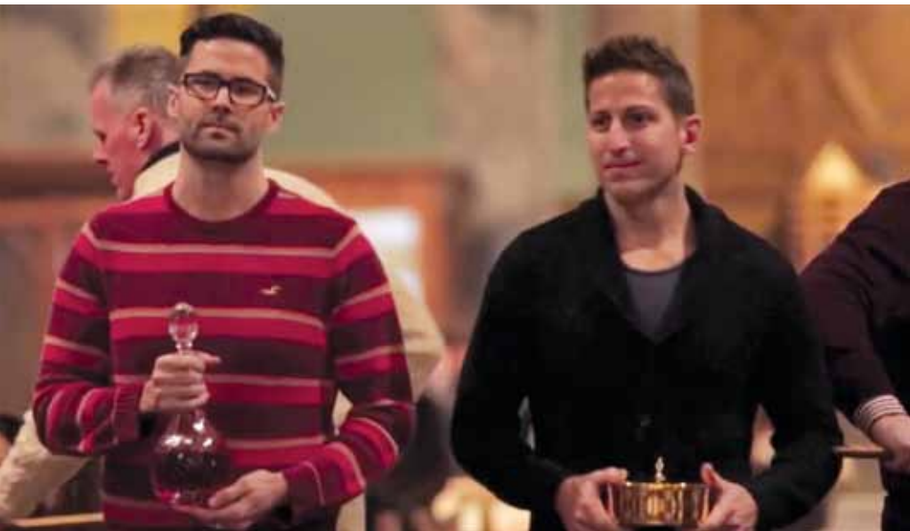
The short video Owning Our Faith eloquently and clearly depicts the struggles LGBT Catholics endure on a daily basis as they try to achieve the full acceptance of LGBT persons in the Catholic Church. The video can be watched at www.owningourfaith.com .