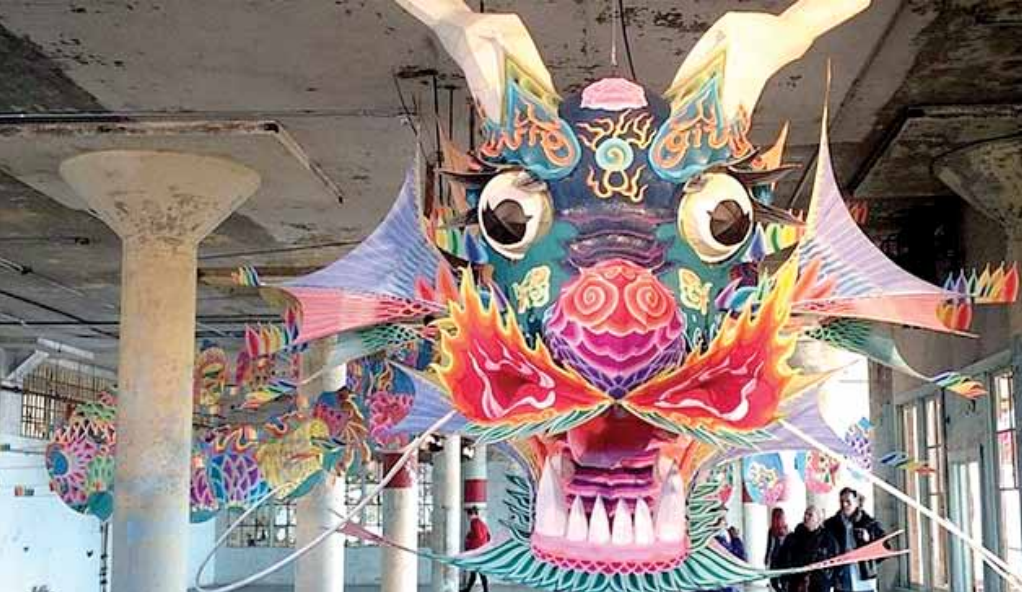
One of Ai Weiwei's installations at Alcatraz

You have until April 26, 2015 to view one of the most unique art installations to be seen anywhere in the United States this year, and a trip to Alcatraz is all that is required.