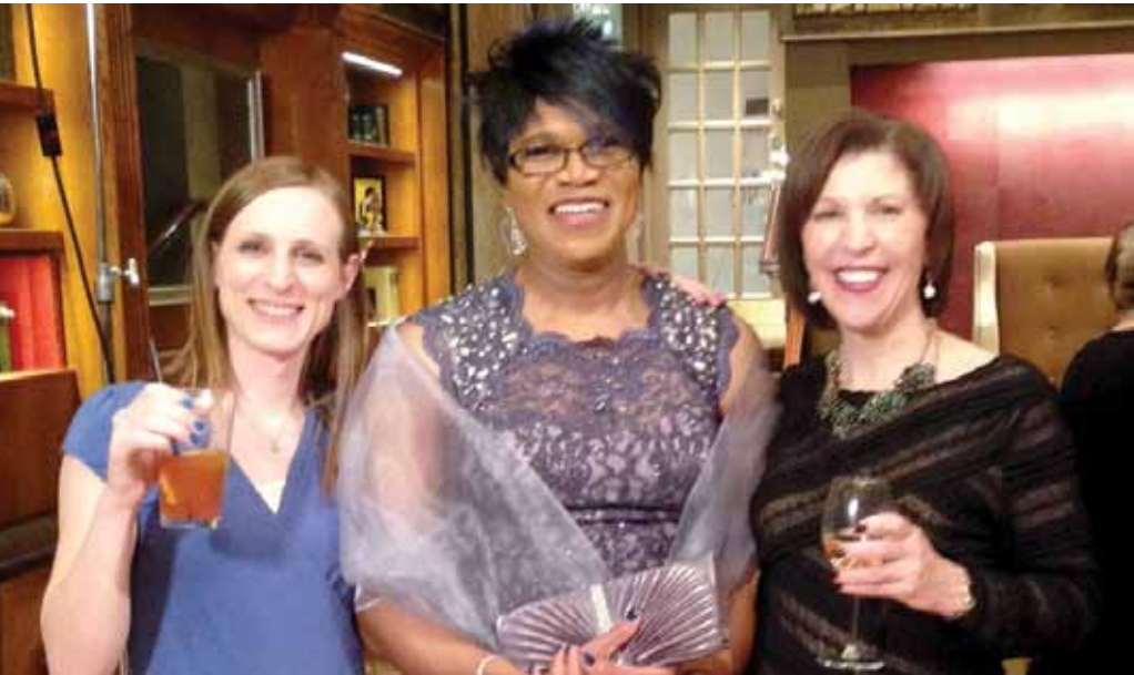
New Girls On The Block follows a group of highly inspirational and entertaining women from Kansas City, MO. – all friends, some couples – who just happen to be transgender, as they confront issues with their relationships, their femininity, their families and friendships, The six-part series will premiere on Discovery Life Channel on Thursday, April 2 at 10 p.m.