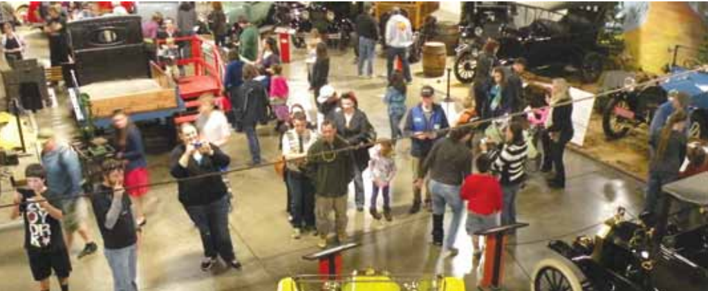
Nearly 25 area museums are taking part in Sacramento Museum Day 2015, including the California Auto Museum.

In a popular cultural tradition designed to encourage all members of the community to experience the Capital City's incredible wealth of art, history, science and wildlife – at little or no cost – Sacramento Museum Day is returning for its 17th year.